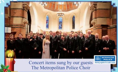
Concert items sung by our guests The Metropolitan Police Choir